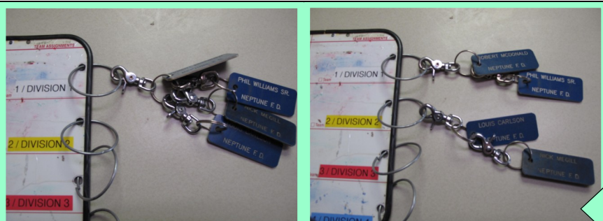
One Team assigned a function

Once members are assigned a task, they give up their tag to the Accountability Board. It is placed on a ring on the board that identifies location / assignment.